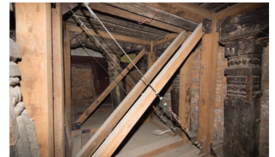
Agamchhen Temple, Kathmandu Durbar Square