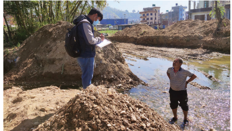
Survey for Flood Assessment of REKV Project

JICA is currently supporting to strengthen capacity of National Disaster Risk Reduction and Management Authority (NDRRMA) through the “Project for Strengthening Disaster Risk Governance for Resilience in the Kathmandu Valley (REKV)”