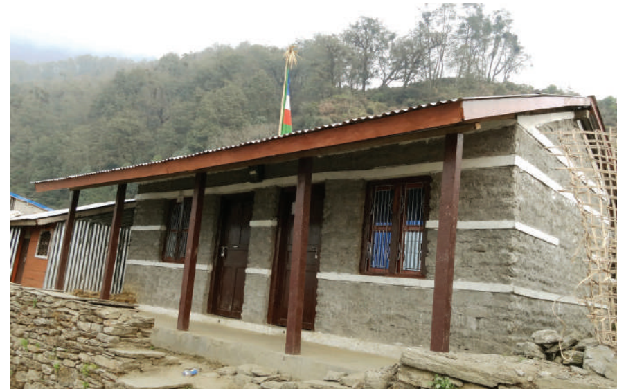
Newly reconstructed house in Barpak, Gorkha