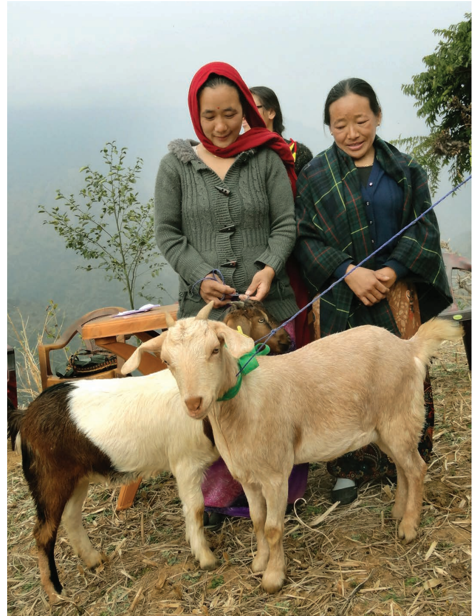
Goat raising training to support in Livelihood Recovery in Barpak, Gorkha.