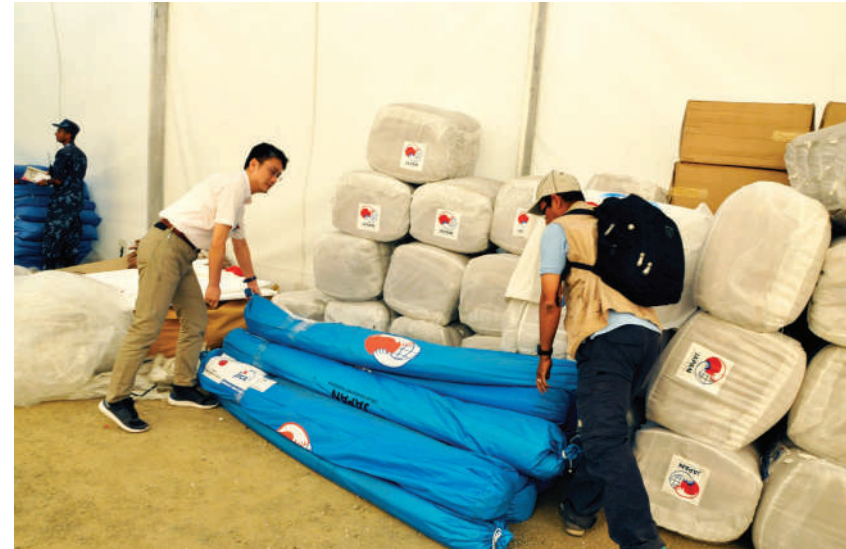
Emergency relief materials from Japan

The government of Japan was one of the first international responders to act quickly by sending a team of experts to the field. Japan Disaster Relief (JDR) team which included the Rescue, Medical, and Self Defense teams arrived in Nepal to provide assistance. Emergency relief supplies were sent through JICA, which included tents, blankets and other essential items to the people affected by the disaster.