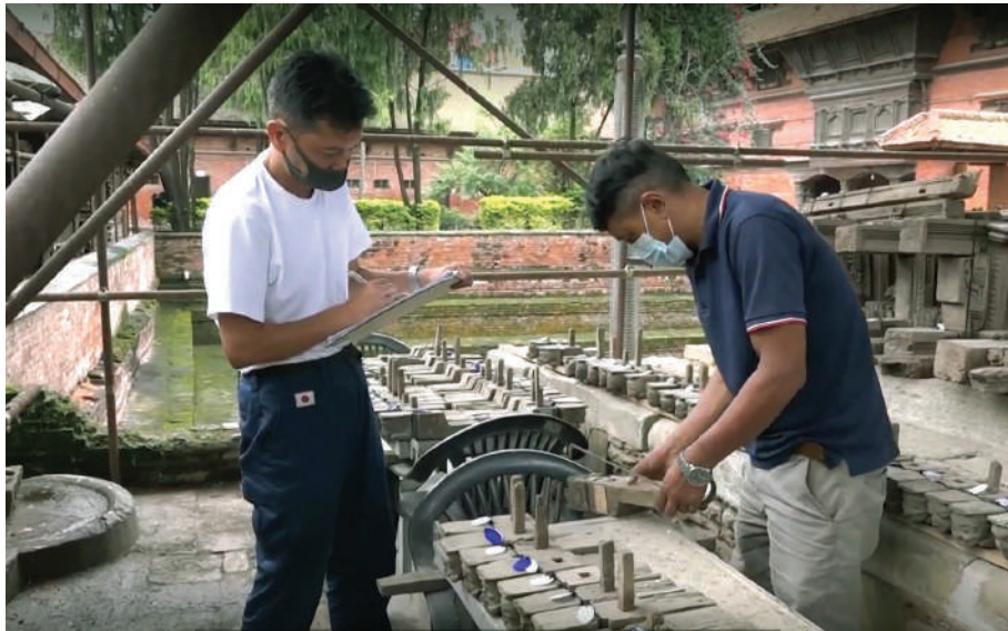
JICA expert surveying artifacts in Shiva Temple, Kathmandu Durbar Square

JICA dispatched Japanese experts to the Department of Archaeology to support the rehabilitation of the Shiva temple and the Agamchhen temple in Kathmandu Durbar Square, and the Degu Taleju temple in Patan Durbar Square.