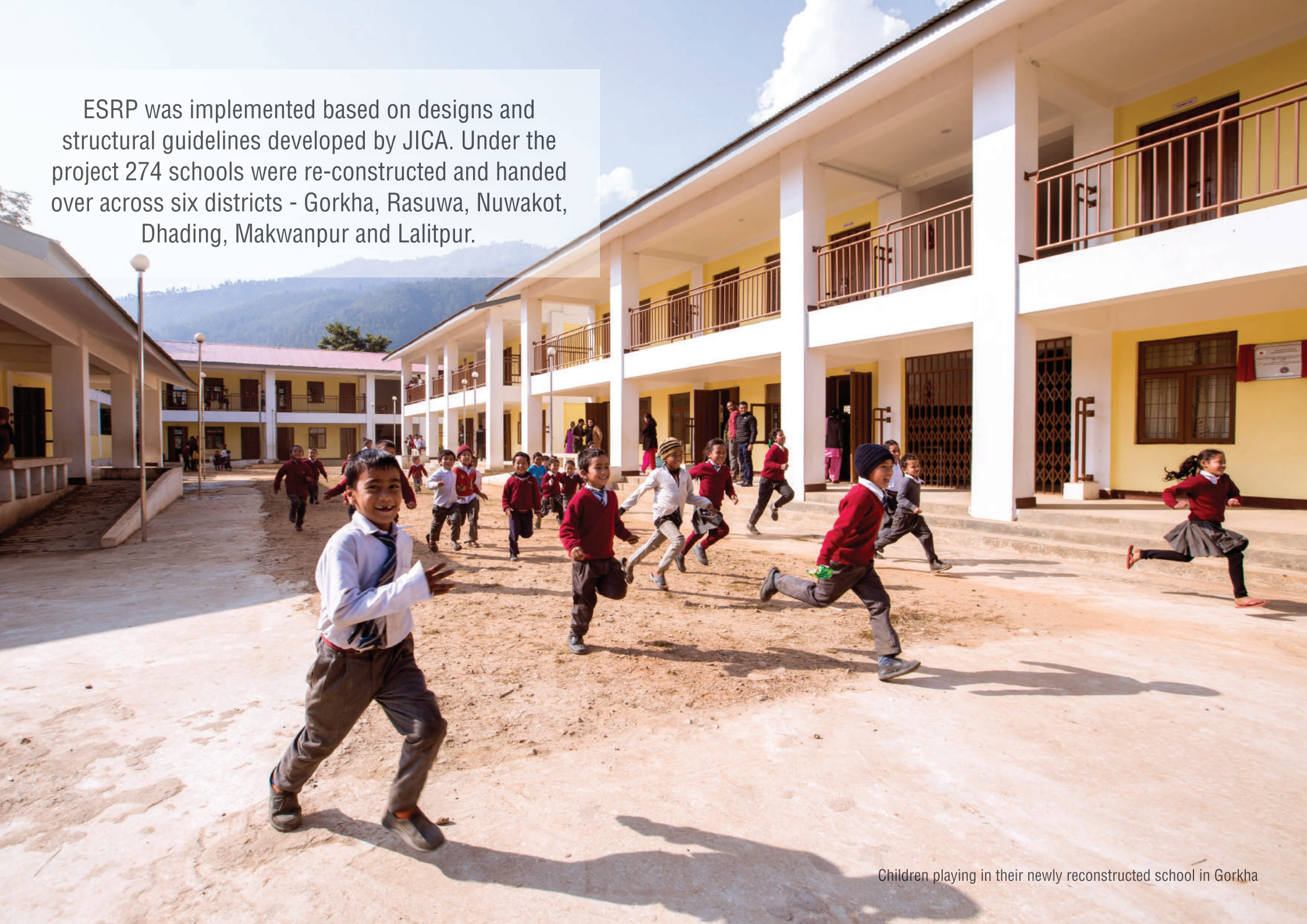
Children playing in their newly reconstructed school in Gorkha

ESRP was implemented based on designs and structural guidelines developed by JICA. Under the project 274 schools were re-constructed and handed over across six districts - Gorkha, Rasuwa, Nuwakot, Dhading, Makwanpur and Lalitpur.