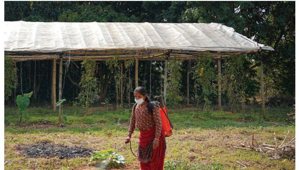
Tunnel farming training for livelihood recovery in Phalate, Sindhupalchowk.