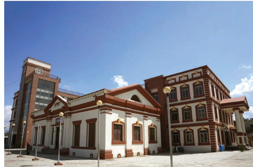
Patan Secondary School, Lalitpur