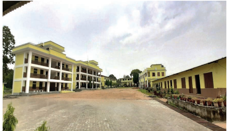
Jyoti Secondary School, Hetauda, Makwanpur