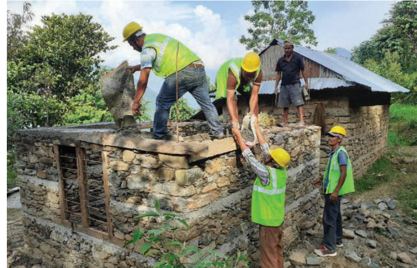
Masons at work in Sindhupalchowk

The mobile masons helped us to build our house brick-by-brick, which is stronger and will not collapse even if another earthquake hits.”