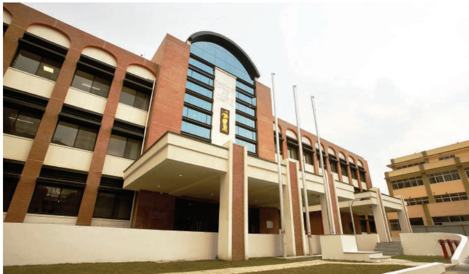
Reconstructed Paropakar Maternity and Women's Hospital, Kathmandu