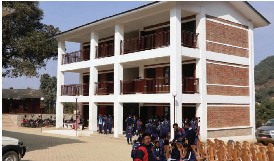
Path Pradarshak Higher Secondary School, Badikhel, Lalitpur