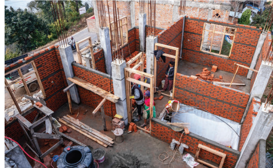
House under construction at Sangachowk, Sindhupalchowk

JICA played a significant role in Nepal's reconstruction and recovery efforts after the earthquake. One of JICA's key initiatives was the Emergency Housing Reconstruction Project (EHRP), funded with the Government of Japan's Official Development Assistance (ODA) loan. The project was designed to use earthquake-resistant standards to reconstruct houses and help people rebuild their lives.