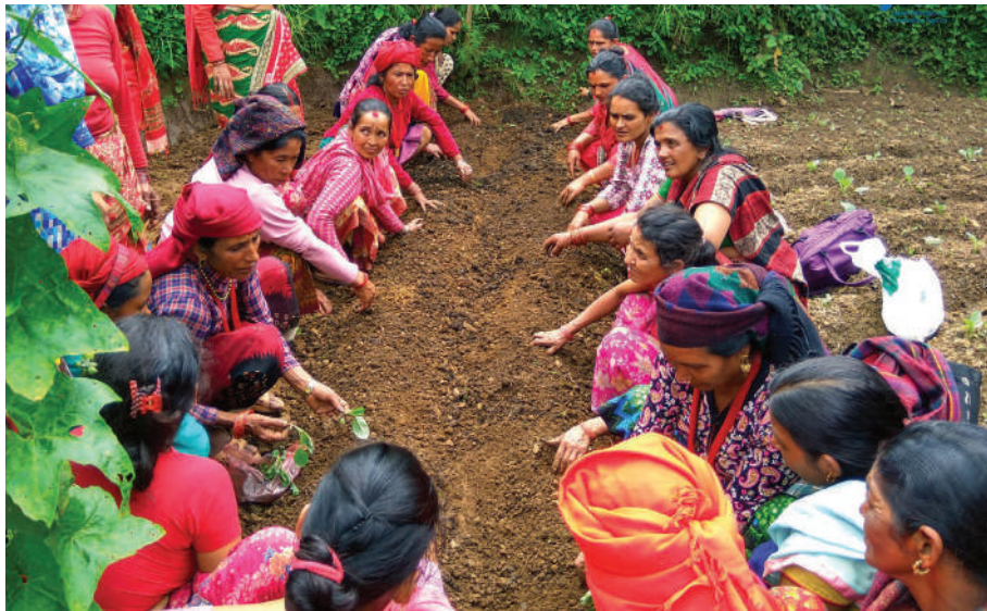
Vegetable farming training for livelihood recovery, Sindhupalchowk

JICA supported the communities through livelihood enhancement training programs such as vegetable growing, quality seed production, and goat raising. Building upon JICA's past recovery and reconstruction efforts, JICA launched the Project for Participatory Rural Recovery (PPRR) in order to increase the capacity of local governments and community groups.