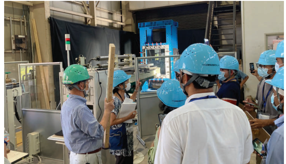
Training participants of NBCC Project visiting a facility in Japan