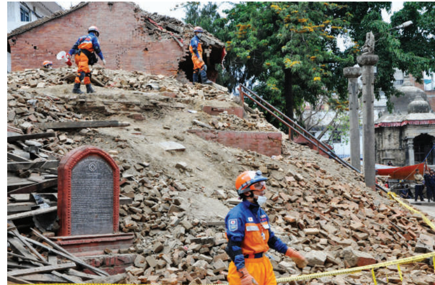
JDR team in search operation at Kathmandu Durbar Square