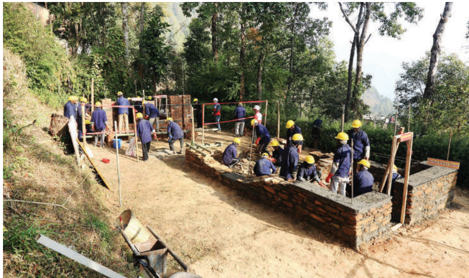
Housing reconstruction training being provided to masons in Sindhupalchowk