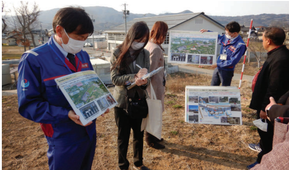
Training participants of REKV Project visiting flood affected site in Japan