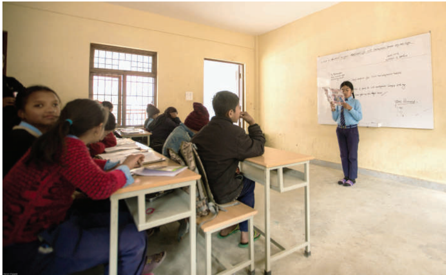
Students in their newly reconstructed classroom in Gorkha .