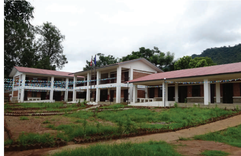
Shree Bal Kalyan Lower Secondary School, Chyangli, Gorkha

With the aim of contributing to the overall recovery and development of earthquake affected communities, particularly in the area of education, JICA provided ODA loan to implement the Emergency School Reconstruction Project (ESRP).