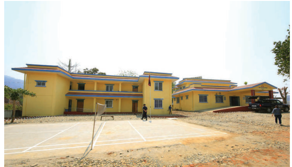
Police Station in Palungtar, Gorkha