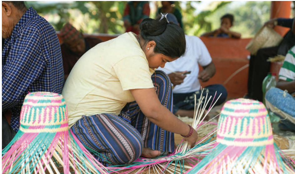
Strengthening community resilience and income generation through handicraft production in Palungtar, Gorkha.