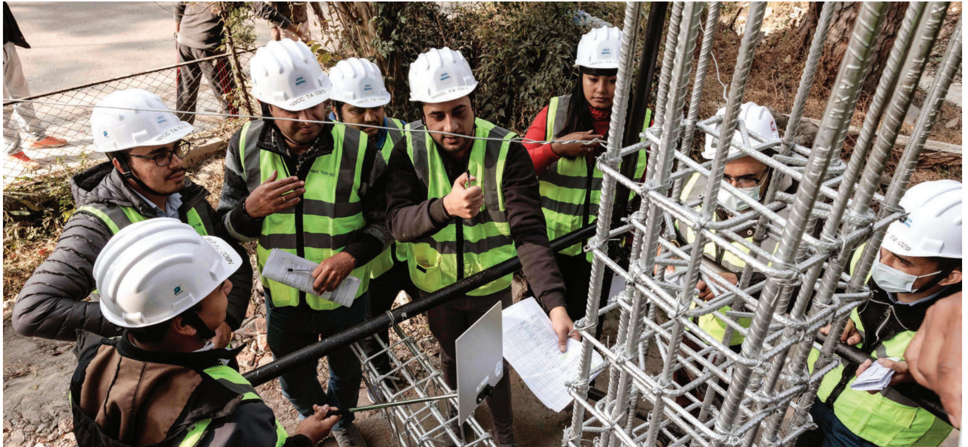
Master Training of Trainers (MTot) program for Engineers by NBCC project

JICA's reconstruction assistance is gradually shifting its focus from post-earthquake reconstruction to disaster risk reduction, transforming to projects for building a disaster resilient country and preparing for future disasters.