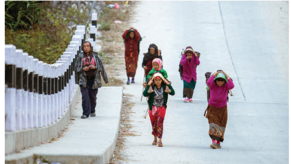
People walking across a newly constructed bridge in Gorkha