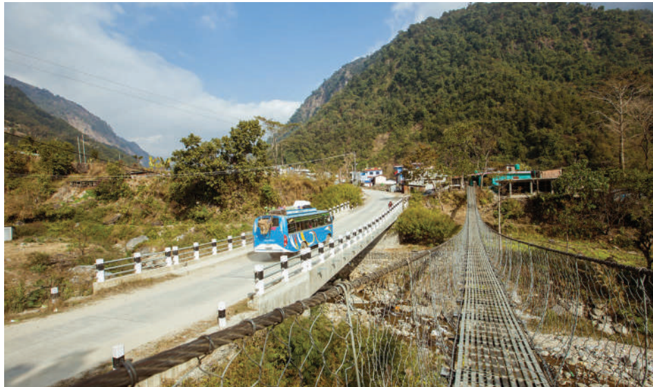
Newly constructed Ghatte Bridge in Gorkha

JICA's Quick Impact Projects (QIPs) played a vital role in the immediate recovery of Gorkha and Sindhupalchowk districts by reconstructing government buildings, bridges, health posts and hospitals in Sindhupalchowk and Gorkha.