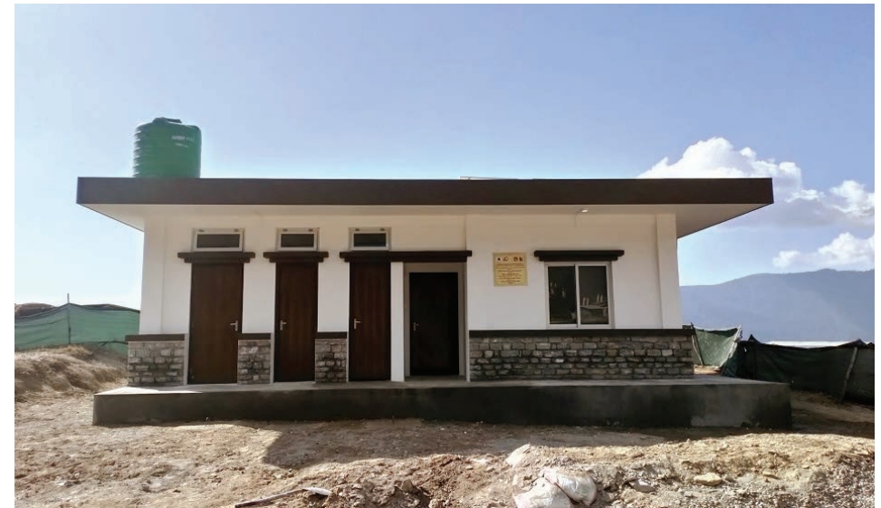
Newly constructed Barpak Women's Community Center in Barpak, Gorkha