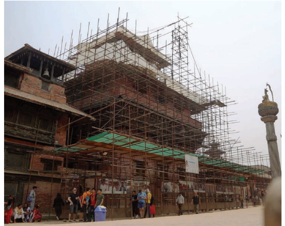
Ongoing rehabilitation work in Degu Taleju Temple, Patan Durbar Square, Lalitpur